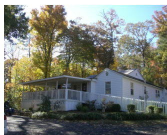
Isaiah House Residence

We offer weekly Narcotics Anonymous and Cocaine Anonymous meetings to the public. These are well attended, with folks arriving early and staying late. There is a very large and wonderful group of men and women in