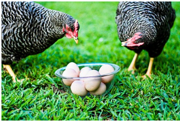
Chickens pondering their eggs.